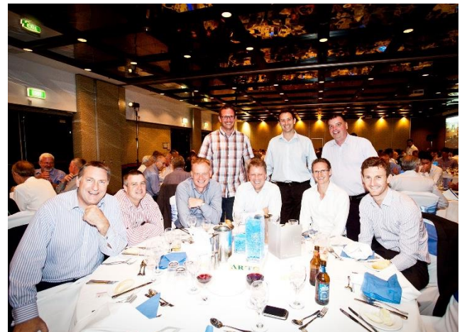
Above: No Tie Dinner attendees 2013