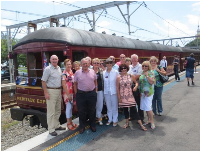
Some of the Australia Day passengers on the Heritage Express train arrive in Newcastle as part of the RTAA's 40th Anniversary celebrations